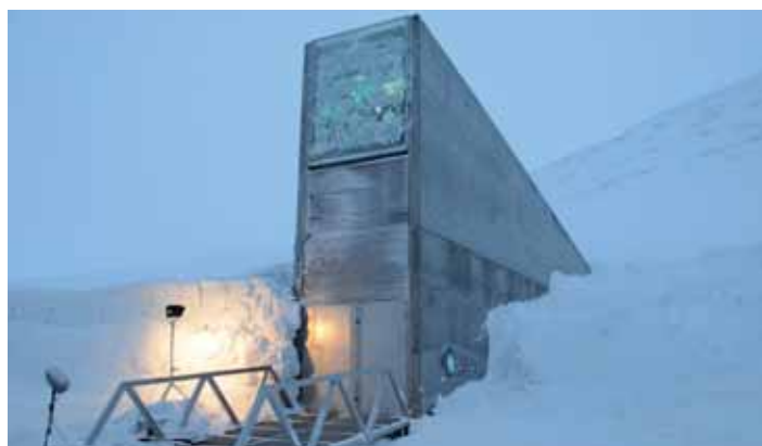
The entrance to the Svalbard Global Seed Vault.

The initiative has intergovernmental endorsement by the FAO Commission of Genetic Resources for Food and Agriculture. It is created in the context of the International Treaty, which provides for countries to cooperate to promote the development of an efficient and sustainable system for ex situ conservation, and the project aims at close integration with other regional and global efforts such as the European AEGIS project, the SGRP of the CGIAR and the projects managed by the Global Crop Diversity Trust. The Seed Vault aspires to become a cornerstone in this emerging global conservation system.