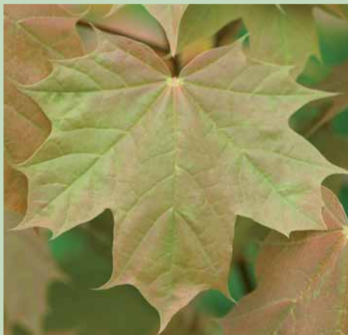
Norway maple ( Acer platanoides ).

Simultaneously with the external review, the meeting agreed to establish a working group to explore the potential added value of and options for a legally binding agreement on forests in the pan-European region. The working group should also provide its findings by the end of 2009. Before the meeting reached an agreement on establishing the working group, a long discussion took place. Some delegates pointed out that the Warsaw Declaration does not provide a clear mandate for a legally binding agreement, although ministers of several countries had suggested at the Warsaw Conference that European countries could explore this avenue, as negotiations on the legally binding instruments on forests have failed at the global level within the UN Forum on Forests (UNFF). Others stressed that the working group should first carefully analyze both benefits and drawbacks of a legally binding agreement before identifying any options for proceeding in this regard. Several delegates were also in favour