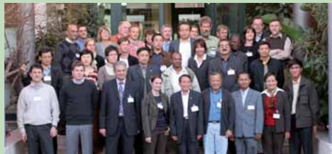
Participants in the joint ECPGR-DIVERSEEDS Inter-regional workshop.

The meeting recognized the added values and benefits to partners related to conservation and use of PGR that are being provided by Regional Networks. These include capacity development, developing common regional information systems, providing a discussion forum for access and benefit sharing arrangements/agreements, providing an environment for formal and informal cooperation and ensuring that the weakest partners in a given region become actively involved in the global system.