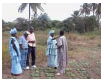
Above: Women growing African leafy vegetables for market in Senegal.