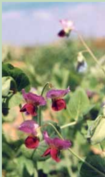
Pisum sativum flowers.

The ECPGR Working Group (WG) on Grain Legumes met for its Fourth meeting in Lisbon, Portugal on 16-17 November 2007, as a Satellite meeting to the Sixth European Conference on Grain Legumes. The Conference discussed progress in legume knowledge, particularly the first outputs from the EU Grain Legumes Integrated Project (GLIP), ending in 2008, which lead the research on nitrogen-fixing plants. GLIP provided some support for the ECPGR Satellite meeting, including a budget for the registration fees of some participants, a meeting room and lunch on the first day.