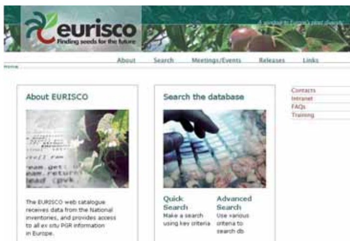
New home page of the EURISCO website.