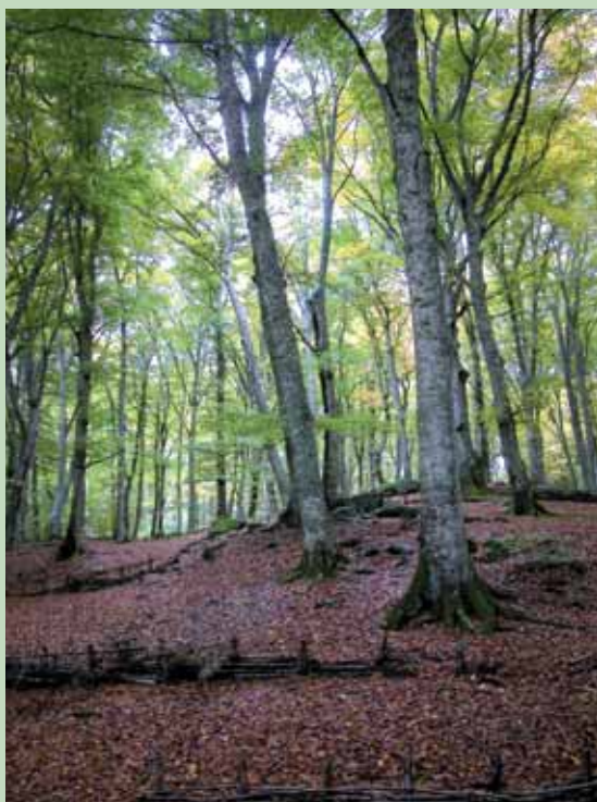
A beech ( Fagus sylvatica) stand in central Italy.

Further information on EUFGIS is available at the EUFORGEN website ( www.euforgen.org ).