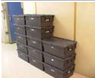
Seeds are packed and boxed for shipment to Svalbard.