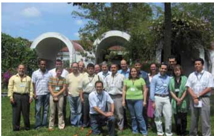
Top: Forestry faculty of the University of the Andes (ULA) Mérida, Venezuela.