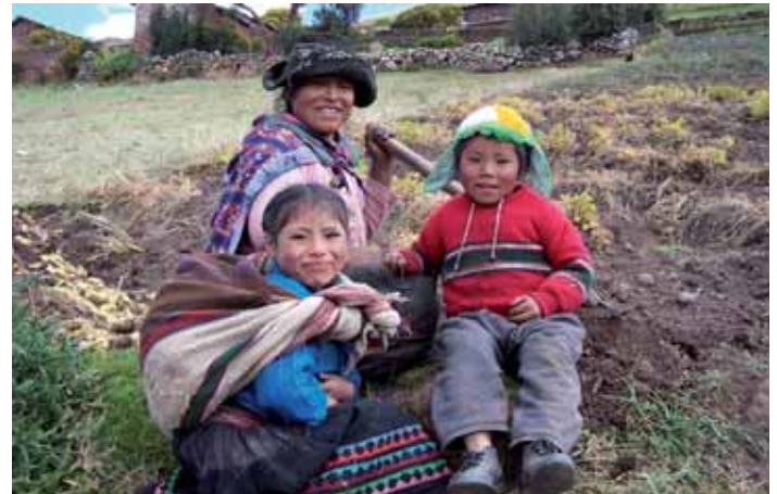
Potatoes are an essential part of the diets of Peruvian farmer families, who maintain potato diversity very much as part of their daily lives.

Needless to say, the International Potato Center, known by its Spanish acronym CIP, is taking advantage of this opportunity to further the cause of the potato. CIP worked