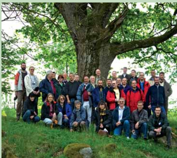
Network members during a field trip.

The summary report of the meeting is available at the EUFORGEN website ( www.euforgen.org ).