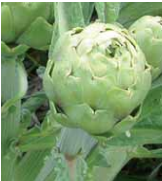
An inflorescence of the "Pertosa" variety.