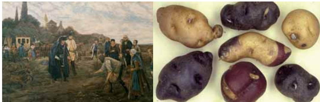
Left: King Frederick II of Prussia checking the potato cultivation of his farmers.