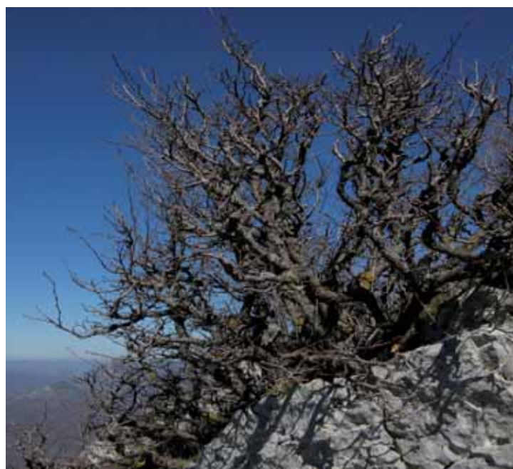
Beech tree growing in extreme environmental conditions, central Italy.