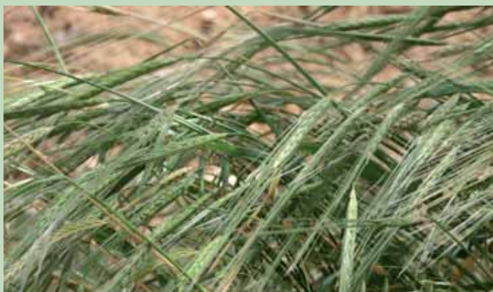
Hordeum spontaneum .

An interesting excursion to AARI in Menemen and the historical site of Bergama (Pergamon), where also many crop wild relatives were found to grow, concluded the meeting.