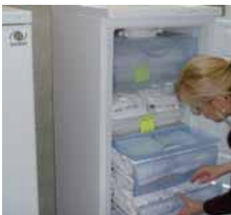
Long-term storage conditions at the National Gene Bank.

The idea to create a safe storage for the world's germplasm was warmly welcomed by the Government of Macedonia FYR and by its academic society. Conscious of the fact that there will be no second chance to preserve this precious material, the Institute of Agriculture was among the first to communicate with Svalbard. Following signature of the Agreement between the Institute of Agriculture and the Royal Norwegian Ministry of Agriculture, the first shipment of 400 accessions is on its way to be stored for future generations.